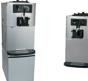
Optional Cart with front opening door (not available with front mount syrup rail)