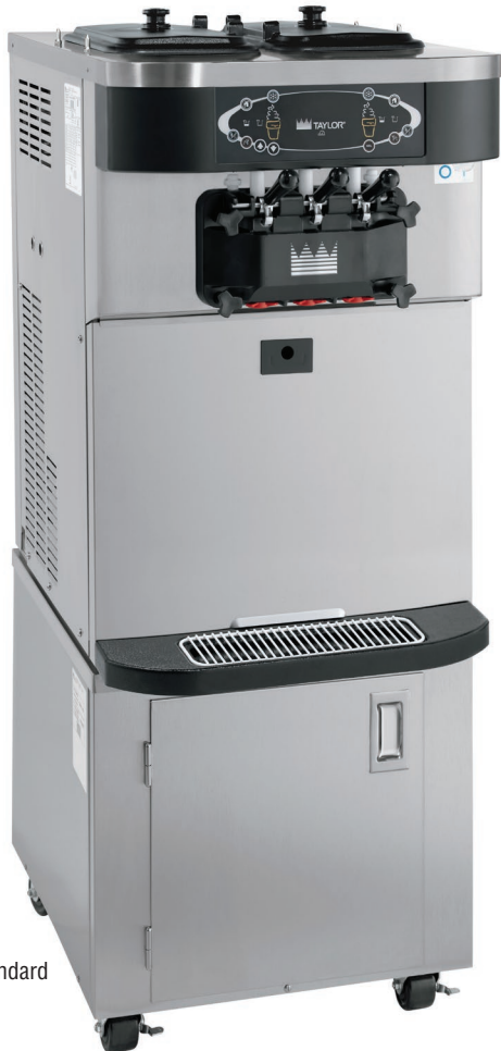
Shown with optional standard height cart.